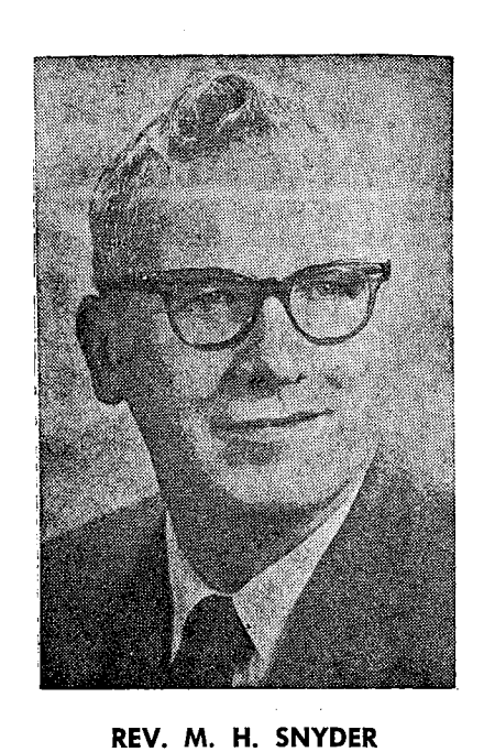
General Superintendent and Presiding Officer