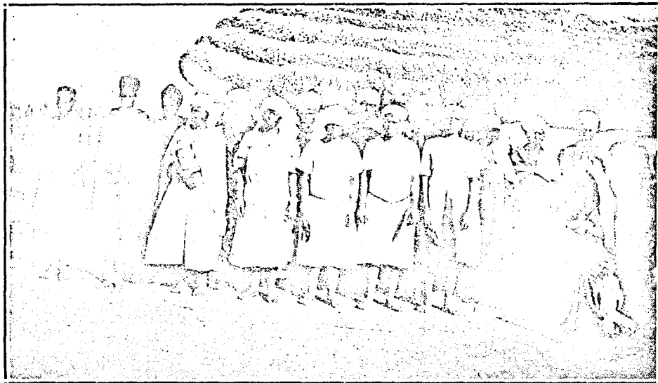
One of Our Pilgrim Schools in Swaziland