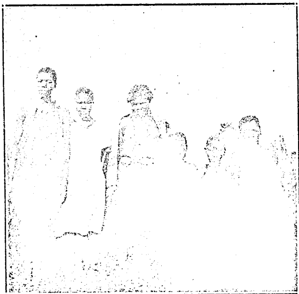
These Girls Were Sold or Traded for Cattle