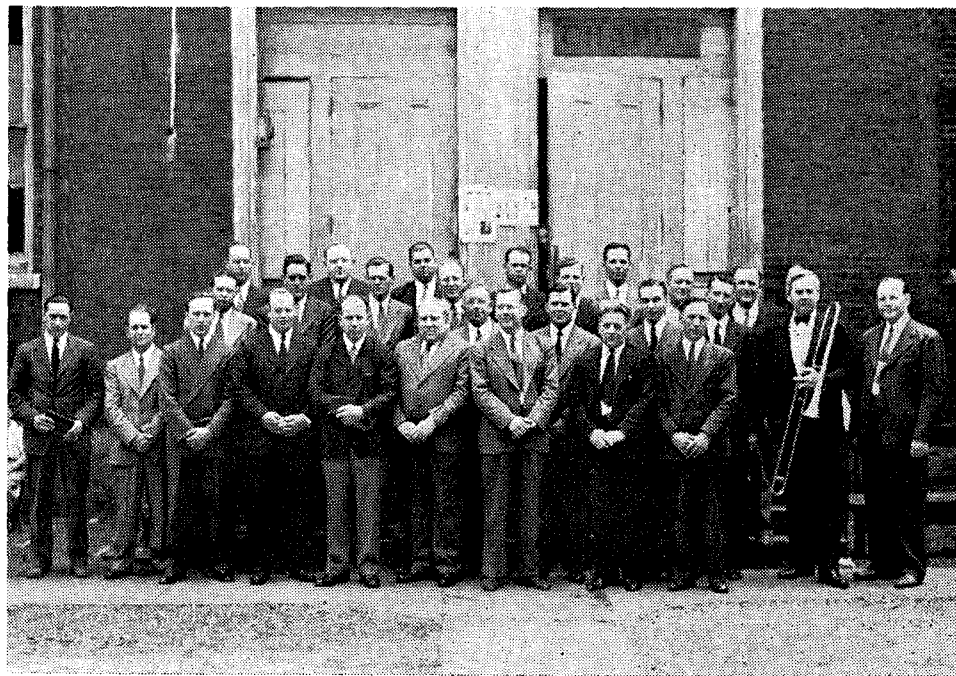
A Group Picture of Some Ministers Present at the 1947 Camp