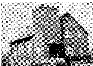
THE FIRST PILGRIM CHURCH

The following churches and their staffs qualified for the respective honors: