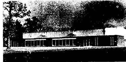
New Student Activity Building (1964)