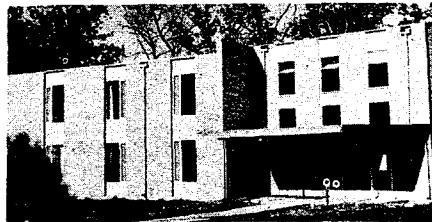
Men's Residence Hall (1966)