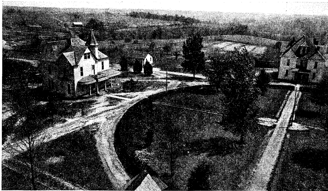
BIRDS-EYE VIEW OF KINGSWOOD COLLEGE