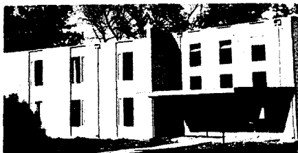
Men's Residence Hall (1966)