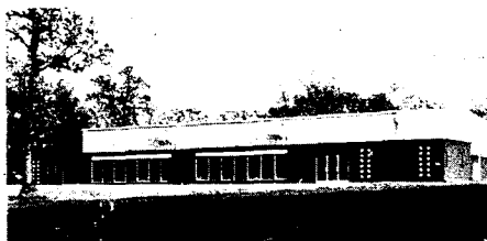
New Student Activity Building (1964)