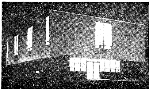
New Library Building (1963)

Owosso College is building for their future