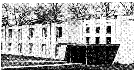
Men's Residence Hall (1966)