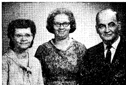
The Singing Schooleys