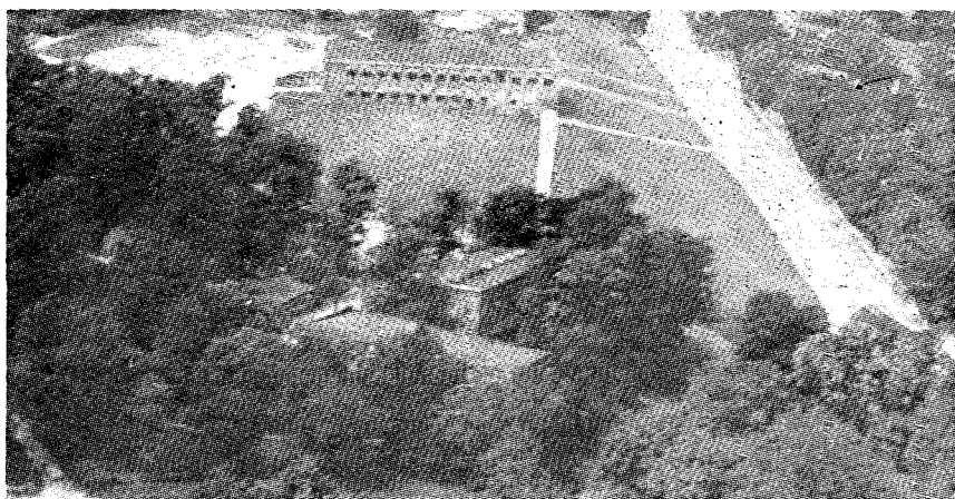
Air View of the College Campus